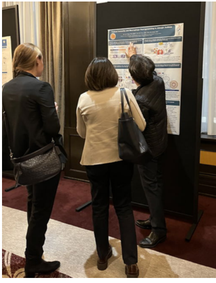
2023 CIA Biennial Symposium Poster Reception Montreal, Canada

Custom graphic [600Wx100H pixels] provided by the sponsor. Graphic will rotate with other ads on the mobile app home page. Ads are subject to CIA approval.