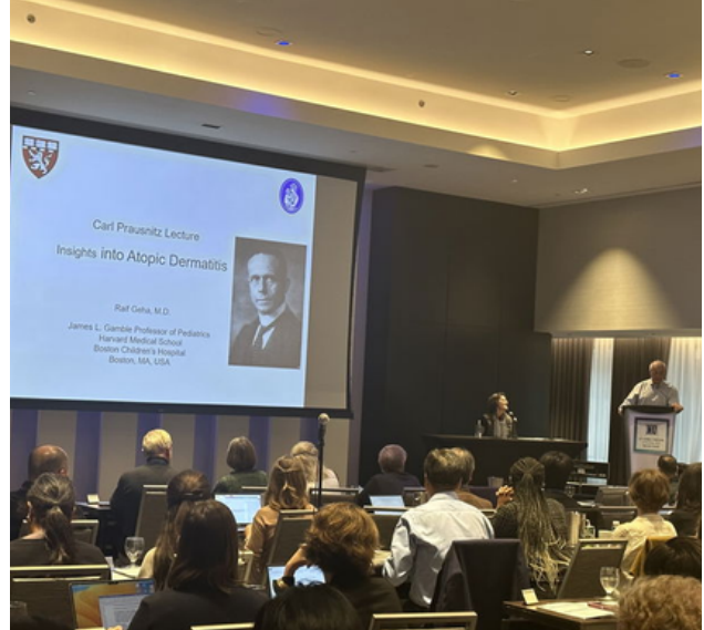
2023 CIA Biennial Symposium Carl Prausnitz Lecture Montreal, Canada