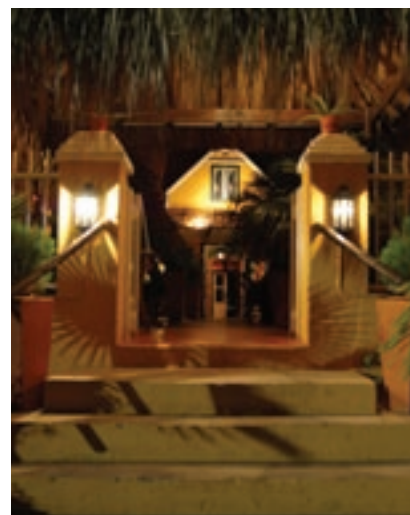
Brakkeput Mei Mei

Shuttles will depart from the World Trade Center, Main Entrance at 19.15.