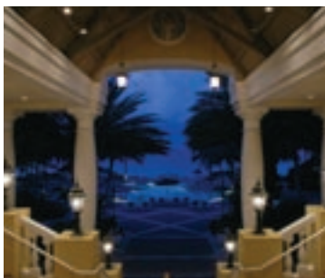
Curaçao Marriott Beach Resort & Emerald Casino (pool and ocean view)

The Welcome Reception will be held poolside at the Curaçao Marriott Beach Resort & Emerald Casino. The pool is set on the ocean's edge, providing a spectacular view for the evening. Musical entertainment will be provided along with open bar and an assortment of hors d'oeuvres.